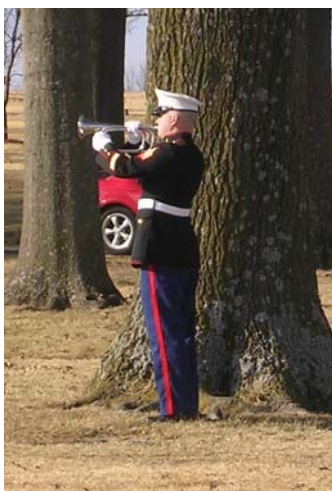
A U.S. Marine Corps bugler plays Taps at Earl's funeral ceremony.