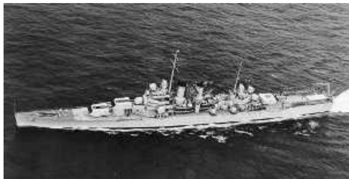
Left: U.S.S. Tabberer Above: U.S.S. Wichita